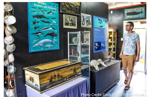
Discover Marine Wildlife and Eco Center