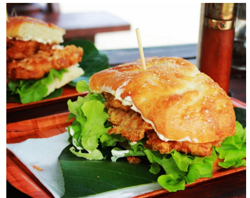
Delicious lunch to end your tour