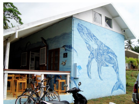
Whale and Wildlife Centre